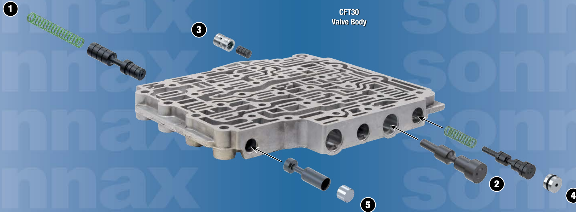
CFT30 Valve Body